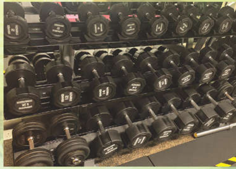
New Dumbbells at the Gymnasium 健身室全新啞鈴