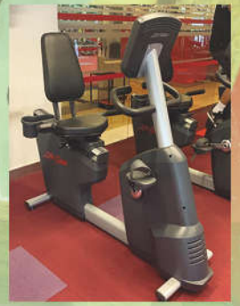
New Bike at the Gymnasium 健身室全新單車