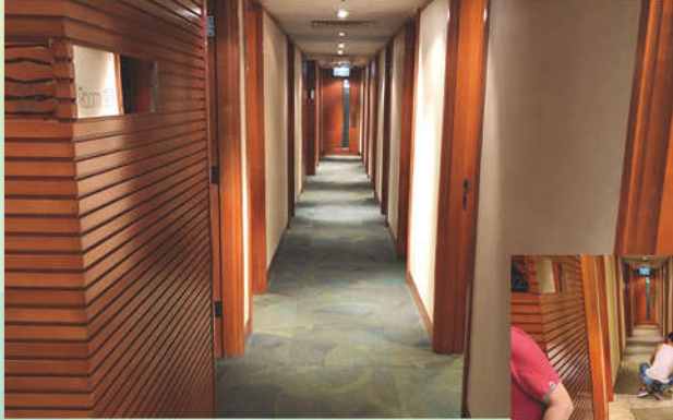
Replacement of the carpet-tiles at the Cards Rooms Area 牌房更換地毯工程