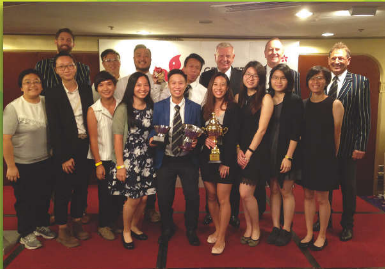
Craigengower at the Cricket HK Awards - a fantastic year