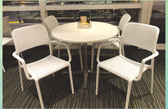
Replacement of dining chairs in Family Lounge 家樂廊更換全新餐椅